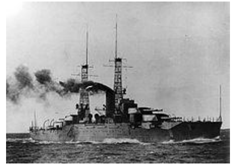
Nevada during her running trials in early 1916