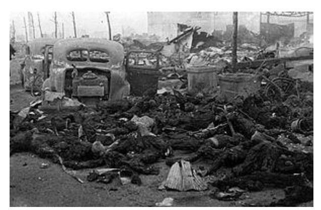
Charred remains of Japanese civilians after the firebombing of Tokyo