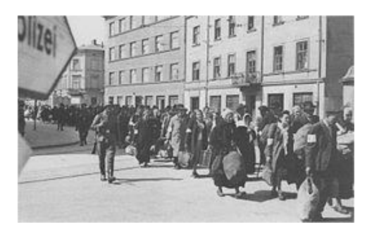
Deportation of Jews from the Ghetto, March 1943