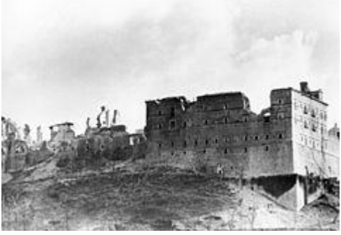
The rebuilt Abbey of Monte Cassino and Monte Cassino in ruins after Allied bombing