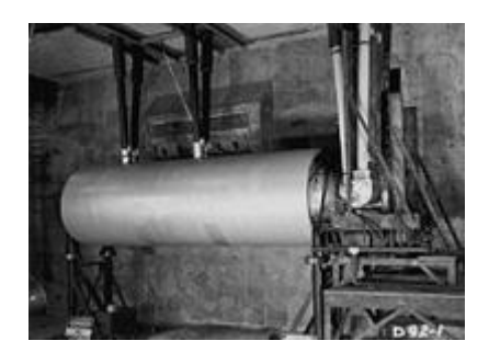
The Shrimp (code name Castle Bravo) device in its shot cab