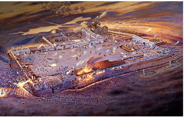
The Alamo, as drawn in 1854.